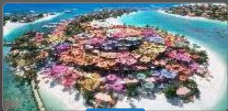
Red Sea project: Luxury tourism