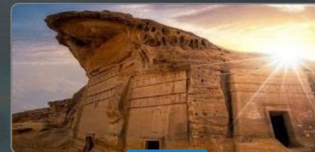
AlUla: Historic site tourism