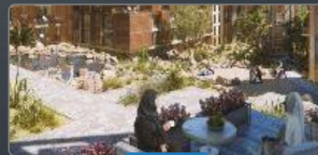
Saudi Downtown: Modern downtowns in 12 cities