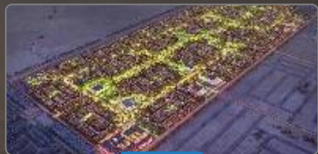
ROSHN: Sustainable communities