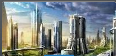
NEOM: Future mega city