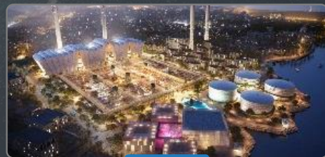
Jeddah Central: Modern residences and hotels