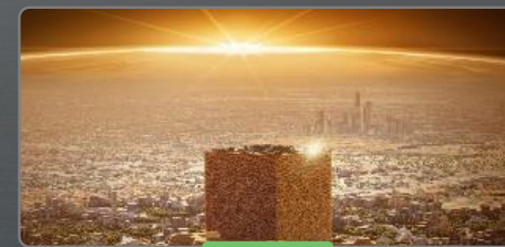
New Murabba: 400m cube shaped skyscraper