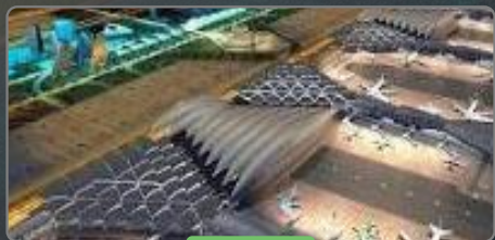
King Salman Airport