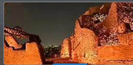
Diriyah: Culture-led tourism destination