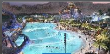
Qiddiya: Sports and Entertainment destination